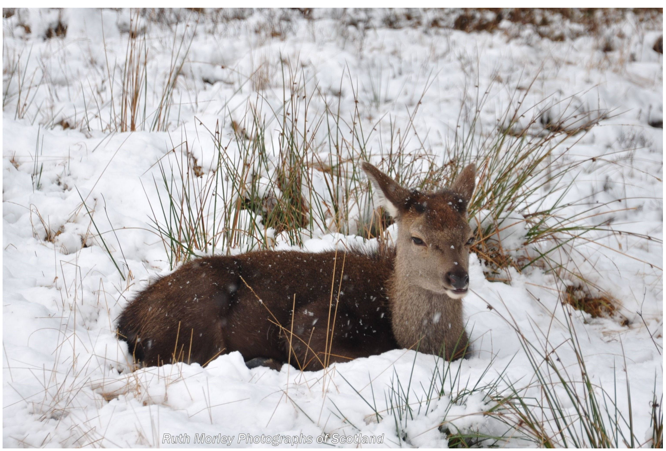
"Young Kilninford stag"